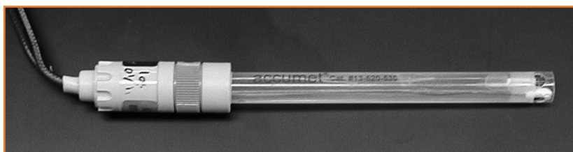
Figure 2 – Typical pH meter probe