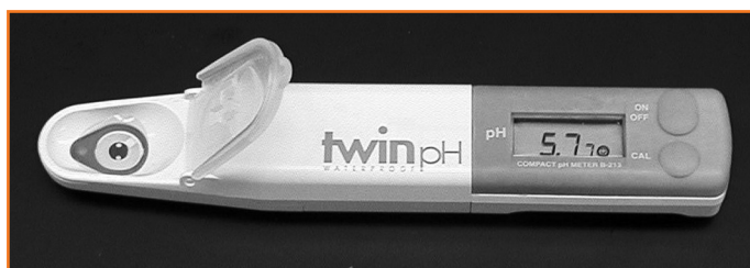
Figure 3 – Typical all-in-one pH meter